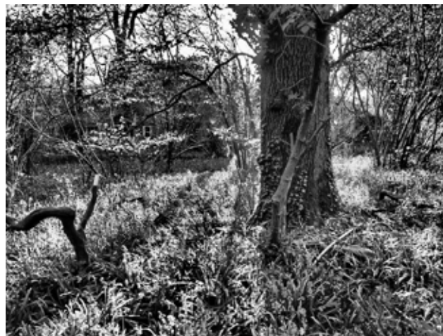
Bluebells in Sparrowgrove in Spring

When Southern Water decided to sell off some of its woodland a few years ago, a group of local residents