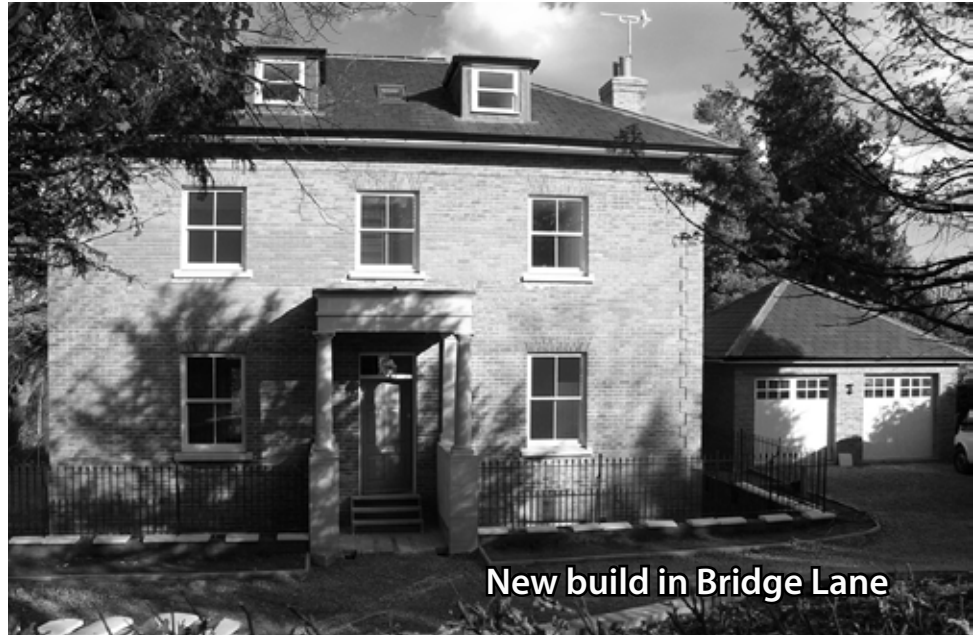
New build in Bridge Lane

The Parish Council will continue to monitor