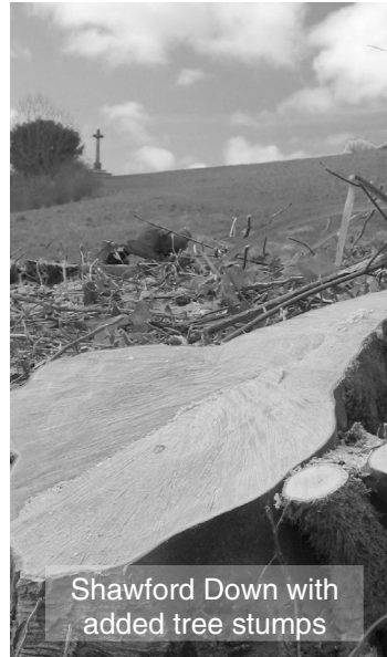
Shawford Down with added tree stumps

I was asked by the PC to try to persuade Network Rail to decimate the trees on the railway embankment which were overhanging our freshly re-fettled Parish Hall, and filling its gutters with