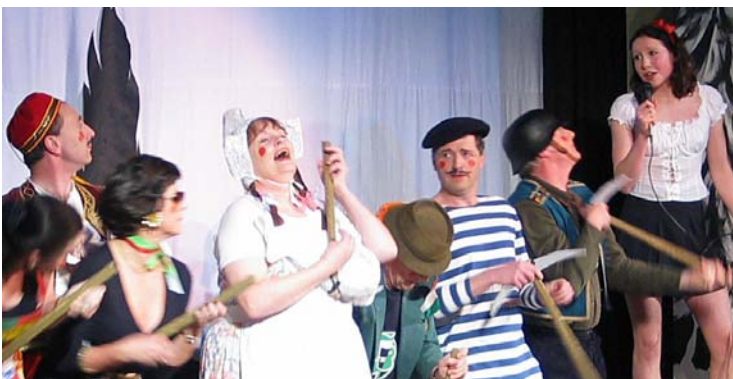
Snow White sings to the Dwarfs

Also being watched with interest is what follow-up action is taken on the government's report entitled 'Private Action, Public Benefit'. This proposes some significant reforms to