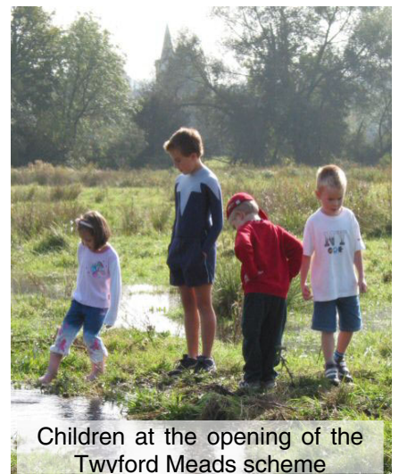
Children at the opening of the Twyford Meads scheme