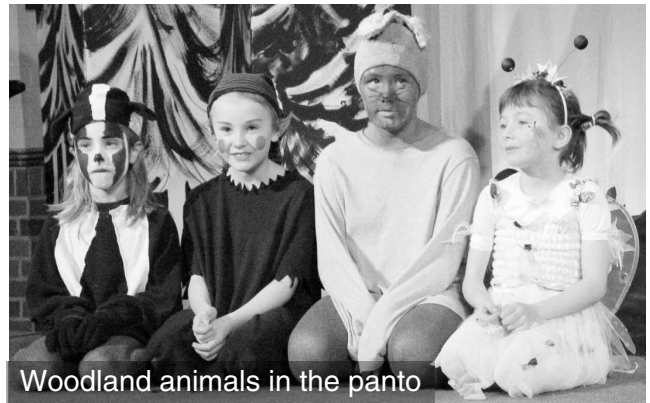
Woodland animals in the panto

We've added three flip chart boards to our props portfolio recently and are in the process of purchasing an electrically driven screen for