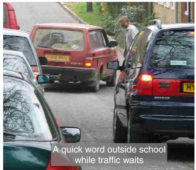
A quick word outside school while traffic waits

The benches in Attwoods Drove and Hurdle Way have been repaired.