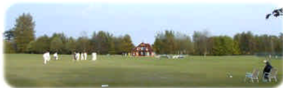
Photo montage of proposed new pavilion

This time last year we had planning permission for the pavil-