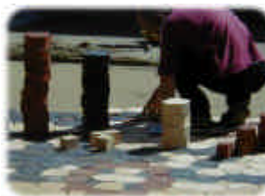
Laying the maze

A time capsule is to be preserved at the Parish Hall near the new paving stone maze.